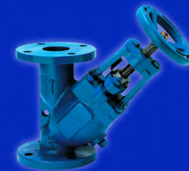
Triple Duty Valves