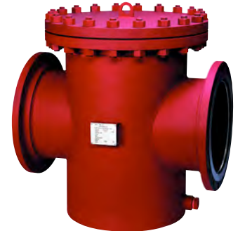
Duplex/Dual Basket Strainers