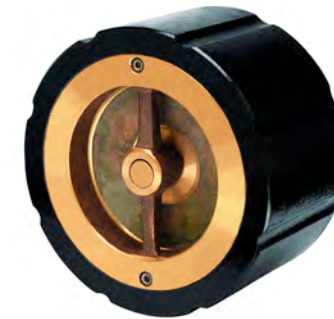
Silent Check Valves