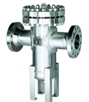
Custom-Fabricated Strainers and Valves, including IFC's Self-Cleaning Strainer