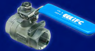
Ball Valves – One-Piece, Two-Piece & Three-Piece

Visit us online at www.islipflowcontrols.com for comprehensive details specifications on all our products. Find helpful downloads, catalogues on all the products we offer, and important certification documents. We will even help you find the right product for your individual applications with our convenient on-line Help List specifier.