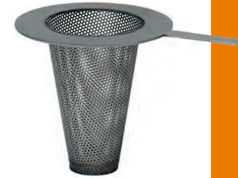
Temp. Cone, Basket & Plate Strainers