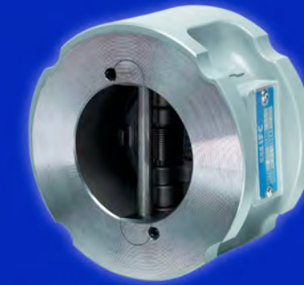
Dual Disc Check Valves