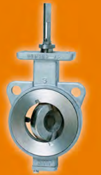
Butterfly Valves – Resilient Seated & High Performance