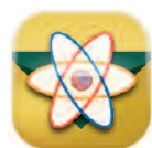
BIOTECH & PHARMACEUTICAL

BLACOH was founded in 1976 with a single mission - design a simple and effective solution to the common problems associated with the start-stop, pulsating fluid flow inherent in process systems using positive displacement pumps. Since those early days our customers have continued to direct our progress and growth, driving product innovations to solve a variety of common process system problems. Today, led by a team with over 60 years of combined experience, BLACOH stands alone as the leader and foremost expert in the manufacture of fluid control products for all facets of municipal and industrial process industries, and virtually every application from the harshest chemicals to the most delicate cosmetics.