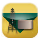
GAS, OIL & PETROCHEMICAL