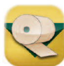
PULP, PAPER & TEXTILE